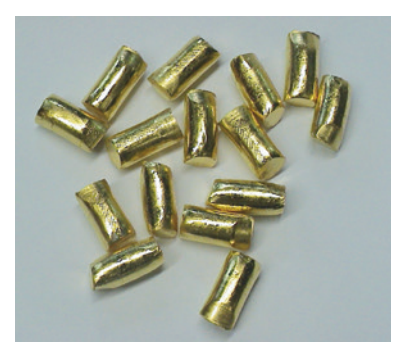
Au 5N 6 x 12 mm slugs