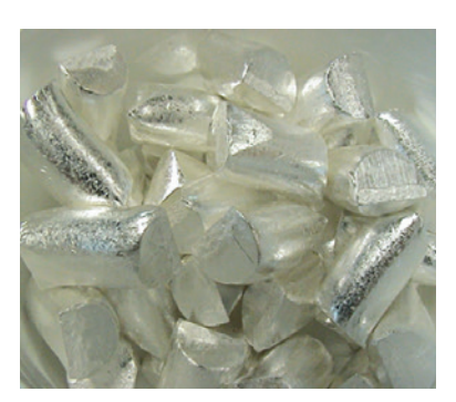
Ag 5N ø 13,5 x 25 mm slugs