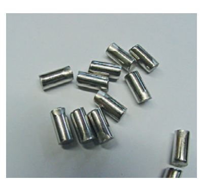
Pt ø 6 x 12 mm slugs