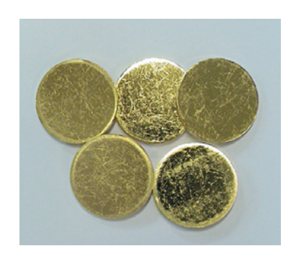
Au 5N ø 20 x 1,5 mm discs

For alloys, which are not listed here, please contact us.