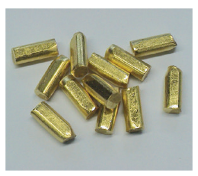
AuAs 0,4% ø 5 x 11,1 mm slugs